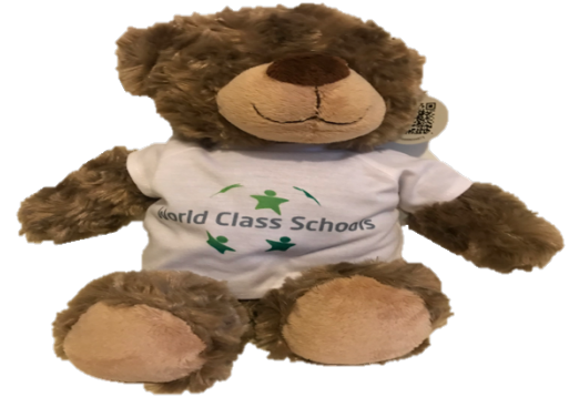
Our famous World Class Bear could be yours