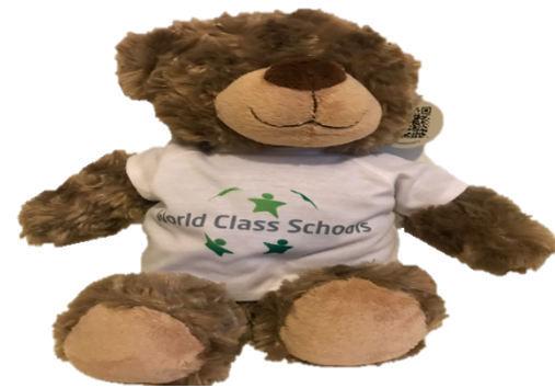
Our famous World Class Bear could be yours

Very smashing prizes, to be announced, the most exciting being